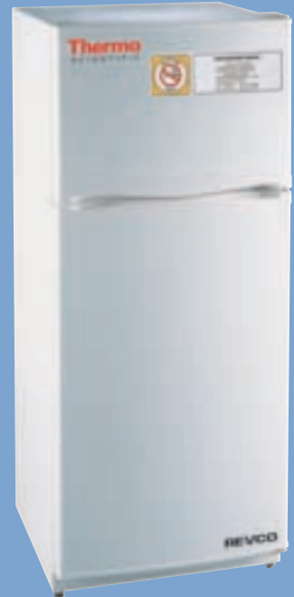
Explosion Proof Refrigerator/Freezer Combination: double door Model RXPC112A.

All electrical components are steel-encased, and cabinet interiors are spark-proof with a non-sparking magnetic door gasket. Foamed-in-place, CFC-free urethane insulation protects against high ambient temperatures.