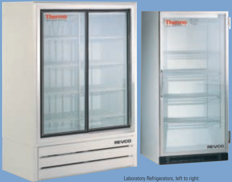
Laboratory Refrigerators, left to right: Models RLR4304A and RLR314A.

Thermo Scientific Revco laboratory refrigerators and freezers are an economical choice for common non-critical laboratory requirements. Models provide dependable refrigeration systems and quality cabinet construction with basic control features.