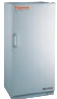
-20°C Laboratory Freezer Model REF2117A.