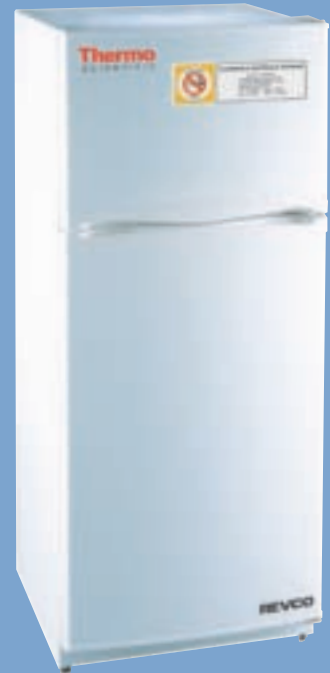
Flammable Material Storage Refrigerator/Freezer Combination: double door Model FMSC112A.

All flammable material storage cabinets feature CFC-free, foamed-in-place cabinet insulation, hermetically sealed refrigeration compressors and adjustable temperature control.